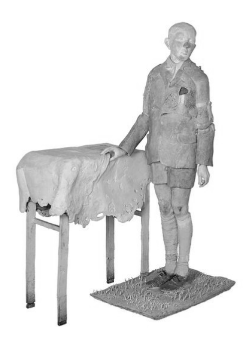
Fig.1 Mirosław Bałka, Remembrance of the First Holy Communion, 1985, coll. Muzeum Sztuki w Łodzi, Poland

Though somewhat restricted, in June 1989, the first free election to be held in the Eastern Bloc took place in Poland. The Lech Wałęsa-led Solidarity Party won a landslide victory. This in turn led to the formation of a coalition government between the Labor and other parties, the