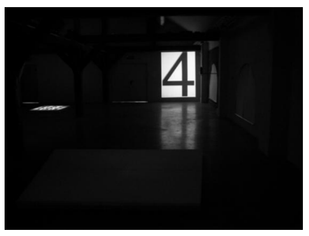
Fig.5 Mirosław Bałka, I Knew It Had 4 in It , 2008

difficult to clearly detect this in the video). The viewer's eyes are dazzled by the bright, blinking light and the blurred image seems like a vague memory (that you can't forget even if you tried!).