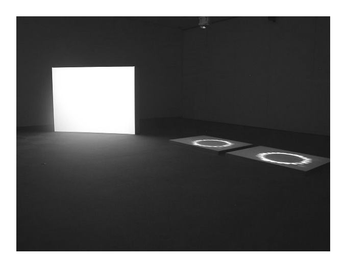
Fig.6 Mirosław Bałka, BlueGasEyes , 2004/ Mirosław Bałka, The Wall , 2006

Prior to this solo exhibition, two of Bałka's video works were included in the "Still/Motion" exhibition[4], which considered the relationship between video and painting, and was held at three locations in Japan. These works were BlueGasEyes (2004) and The Wall (2006) [Fig.6]. In