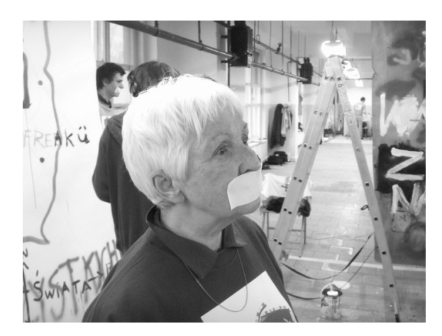
Fig. 9 Artur Żmijewski, Them, 2007