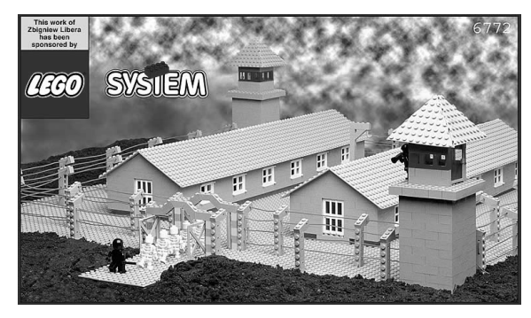
Fig.11 Zbigniew Libera, Lego Concentration Camp, 1996

Finally, I'd like to touch on the work of Zbigniew Libera (b. 1959). Also involved in photography and video, as well as installations which make use of a variety of objects, Libera is particularly notable for the inclusion of political intent in his work, and controversial attempts to make incisive statements against stereotypes in contemporary culture. For example, his Lego Concentration Camp (1996) [Fig.11] series, created with Lego blocks, reproduces scenes