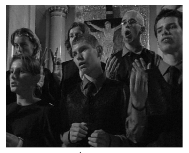
Fig.8 Artur Żmijewski, The Singing Lesson 1, 2001