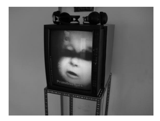
Fig.2 Mirosław Bałka, Primitive, 2008

inspires the viewer to imagine another form. Many of Bałka's video works are extremely simple and repeat over a short cycle of time, giving this detached instant a symbolic quality. Perhaps due to their simplicity, the works are imbued with strong symbolism and have the effect of clearly stating the artist's intention. A notable example of this is Primitive (2008) [Fig.2], shown on a small monitor placed just in front of the entrance to his solo exhibition, "Jetzt," in Wrocław in 2008. This work, consisting only of a few-second-long, continuously repeating video, was taken from Claude the film