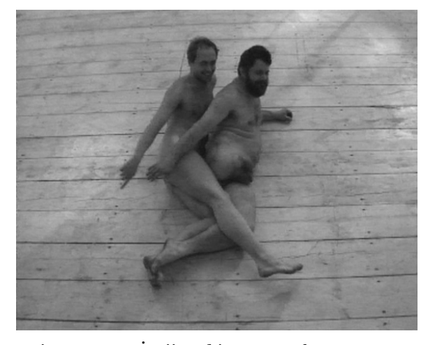
Fig.7 Artur Żmijewski, An Eye for an Eye , 1998

Them (2007) [Fig.9], is a significant and highly-acclaimed work that was first shown at Documenta 12 in Kassel in 2007. To create it, Żmijewski conducted a workshop for a variety, or more precisely, a number of completely different groups with diametrically opposed viewpoints, including conservatives, Catholics, nationalists, members of the Polish Jewish Youth Organization, and socialists. The results were captured on video and turned into this work. The