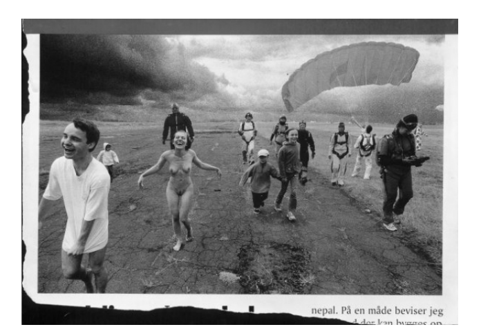
Fig.12 Zbigniew Libera, Nepal , 2003, from the series Positives

Prize-winning photograph of a young Vietnamese girl running from the scene of a napalm attack by the U.S. army as she screams with pain and fear (an image which helped the anti-war movement gain momentum in the 1970s). Libera, however, has changed this into a "positive" image, and replaced the Vietnamese girl with a smiling, nude European woman in a work that calls up memories of the earlier image but also functions to question the current state of the world [Fig.12]. Other examples include altering a photo of a group of Jewish people facing the camera just after