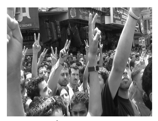
Fig.10 Artur Żmijewski, Democracies, 2009

session proceeds in a pleasant and polite fashion at the outset, but gradually the participants lose their control, and become enraged, as the discussion erupts into a quarrel and the calm gives way to threats and intimations of violence. The process is comical and at the same time, one is struck by the idea that they are watching an archetype of the conflicts that are currently underway all over the world. In the final segment, in which the picture catches fire and burns up as it overlaps with images of riots and conflict, laughter changes to fear and silence overtakes the scene.