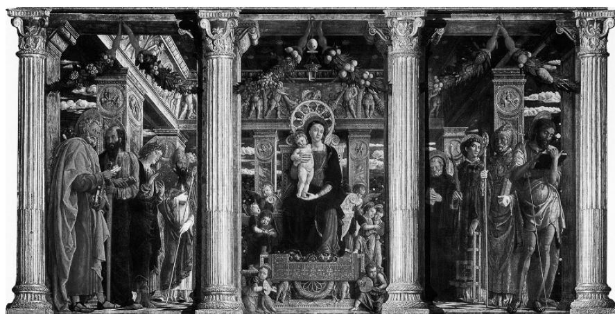
Fig.2 The main scene of Fig. 1