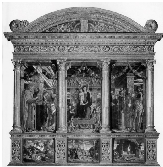
Fig.1 Andrea Mantegna, the San Zeno Altarpiece (the end of 1456–1459), Basilica di San Zeno, Verona.

Although the most diffused form of altarpieces in northern Italy during the mid-15th century were in the gilded, ornate Gothic style, the San Zeno Altarpiece included details referring to classical antiquity. Mantegna related its framework to the sacra conversazione (sacred conversation), seen in the center of the work (Fig. 2), and its naturalistic technique subsequently became a model for various northern