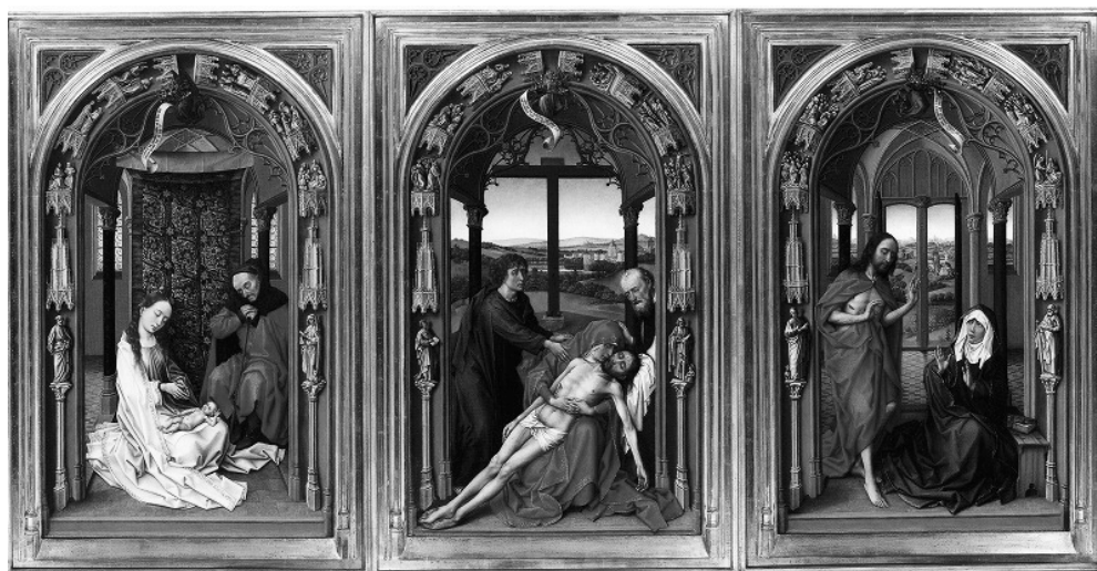
Fig.5 Rogier van der Weyden, Miraflores Altarpiece (c. 1440), Gemäldegalerie, Berlin.

In Ciriaco d’Ancona’s admiration of the altarpiece by van der Weyden, he referred to “deep green grass, flowers, trees, and the leafy and shadowy hills, in addition to the porch and narthex[18].” This further indicates that these works depicted not only the architecture but also the surrounding landscape. Therefore, this author proposes that the Ferrara Altarpiece by van der Weyden was similar to the Miraflores Altarpiece (Fig. 5) in which the depicted architecture and the landscape were combined. It is plausible that the lost Ferrara Altarpiece (created before 1449) adapted this compositional technique since this characteristic of van der Weyden appeared