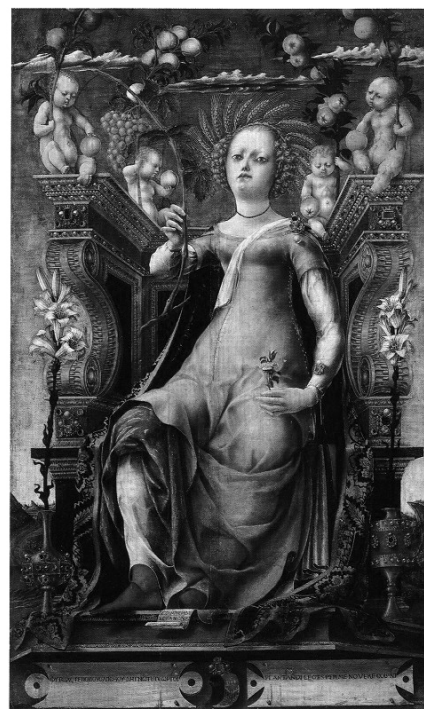
Fig.6 Michele Pannonio, Thaleia (c. 1450), Museum of Fine Arts, Budapest.

This approach of connecting the background of the scenes with the predella can also be found in Tuscan art. However, in northern Italy, this unification of pictorial space was not widespread. Therefore, with regard to Mantegna, it is possible that he was inspired by Giotto's